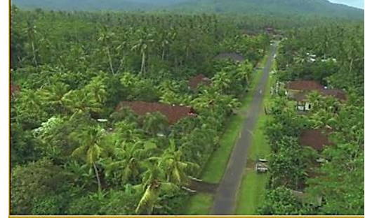
Figure 1. Blimbingsari Tourism Village